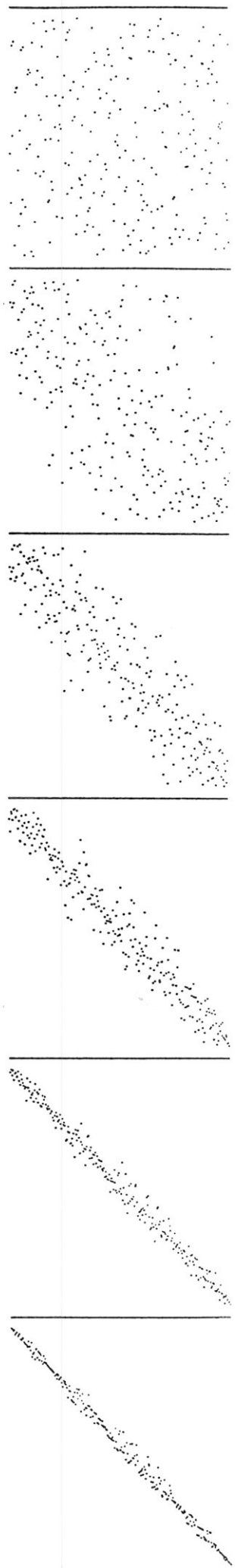
Figure 1. Shaker sort